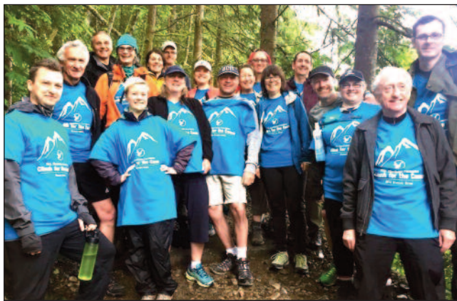
Hikers at the start of the Climb for the Cause in 2017.

The TCF raises money every spring at an event called the Climb for the Cause. Volunteers raise money by hiking up Grouse Mountain. They ask family, friends, and businesses to sponsor their climb.